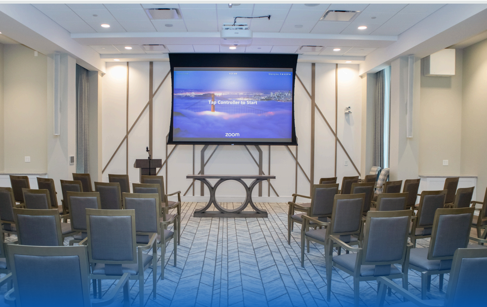
A Da-Lite screen, an Epson projector, and a Biamp audio system offer an immersive experience in the Chapel.

Overall, the Glenaire expansion project shows the polished results of a strong partnership between a senior lifestyle community and a qualified AV solutions provider. Confident that residents will continue to enjoy the benefits of the AV systems for years to come, Brightspire and Solutionz look forward to the future with this great partnership!