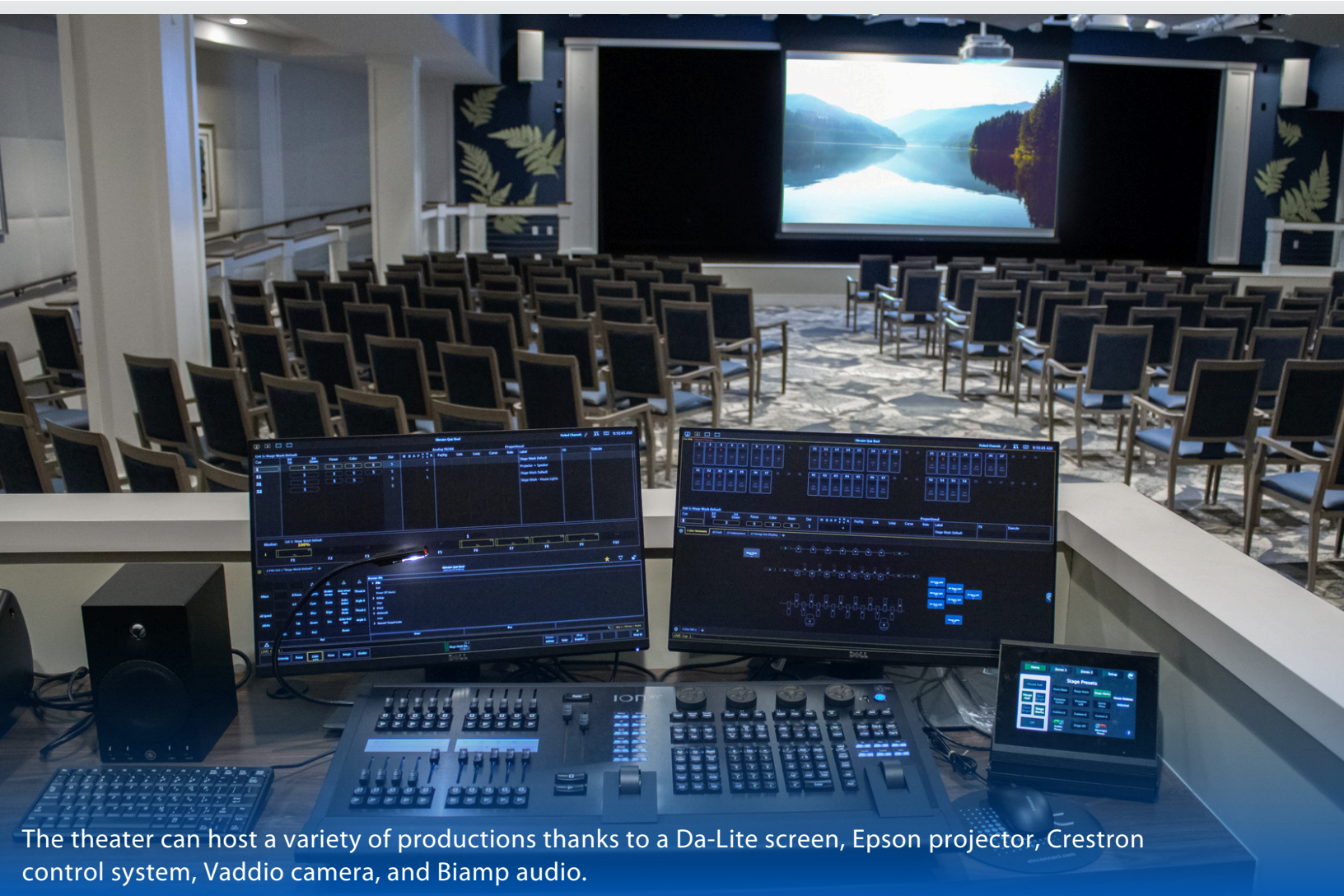
The theater can host a variety of productions thanks to a Da-Lite screen, Epson projector, Crestron control system, Vaddio camera, and Biamp audio.

As part of a commitment to exceptional customer service, Solutionz provides comprehensive ongoing service and support for Glenaire's audiovisual systems. Our team of experts ensures seamless operation through our premier remote monitoring and management service which enables resetting devices remotely, so systems are optimized when users engage.