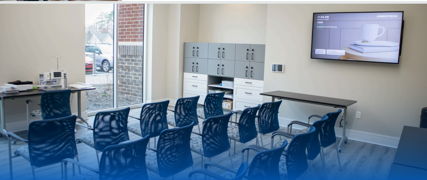
A small Crestron control panel operates the ViewSonic display in the arts center.

“ The project did have its hurdles. Unexpected challenges arose with the mechanical engineering, requiring collaboration between Solutionz and our team to find suitable locations for cabling and equipment. ”